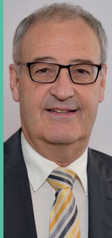
Guy Parmelin, Federal Councillor

“The life sciences cluster of the Basel Area is not only hugely important for Switzerland’s economy, but also occupies a leading position both in Europe and globally.”